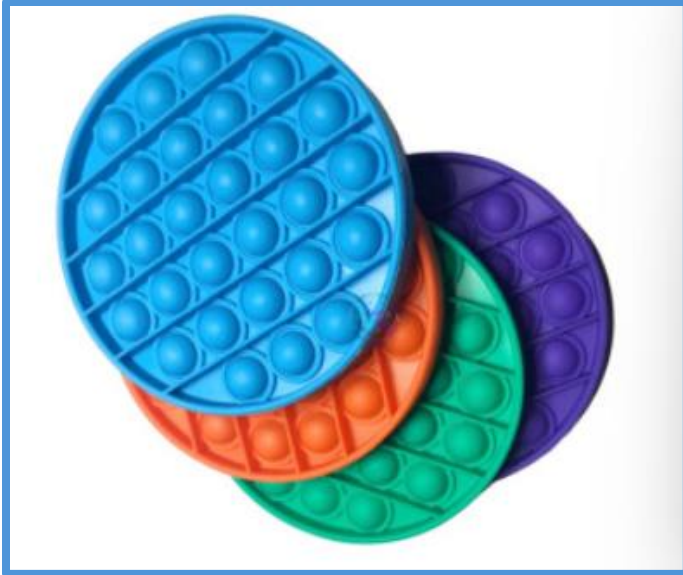
Round Bubbles Push Pop