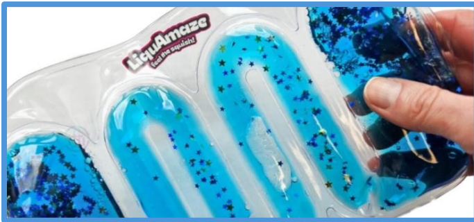
LiquAmaze Gel Fidget