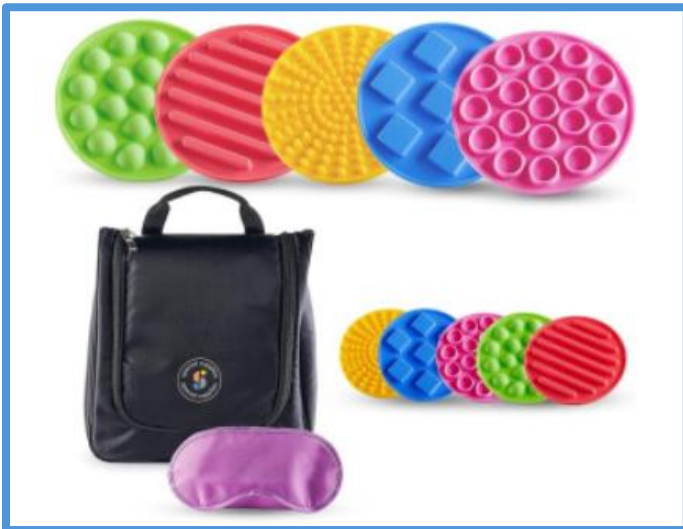
Textured Silicone Tiles Set