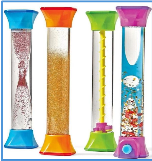
Sensory Tube Fidget Set